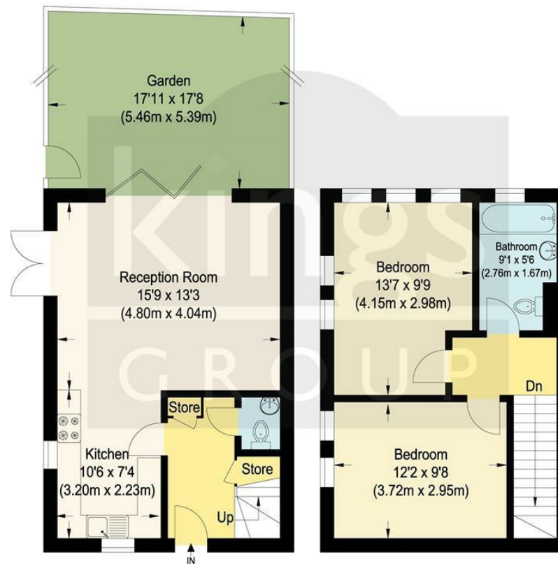
Farorna Walk Approximate Gross Internal Floor Area : 70.0 sq m / 753.47 sq ft Illustration for identification purposes only, measurements are approximate, not to scale.